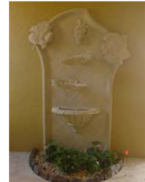
Tier Leaf Fountain