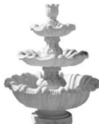
F3-01 51" Dia. x 48"