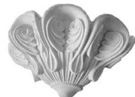
#HB06 22 1/2" Dia. 9 3/4" Height