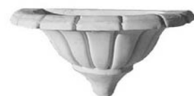
#HB02 36 1/2" Dia. 18 1/2" Height