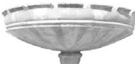
#HB07 36" Dia. 12 1/2" Height