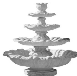
F4-01 51" Dia. x 60"