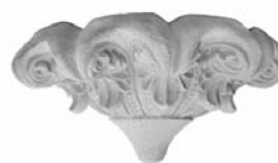
#HB05 37 1/2" Dia. 18 1/2" Height